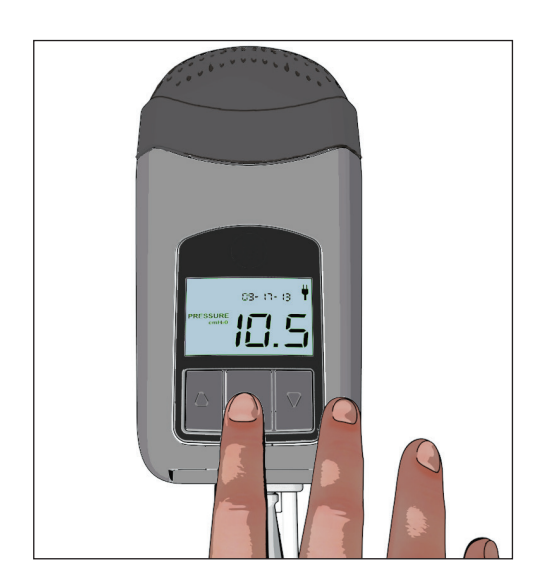
NOTE for Z1: The Auto Stop Feature will stop the therapy if a large air leak is detected between the Z1 outlet and the mask. This may also happen at times when the mask is not being worn properly. This common condition should be resolved once all connections are secure, the mask is properly worn, and the Start/Stop Button has been pushed.